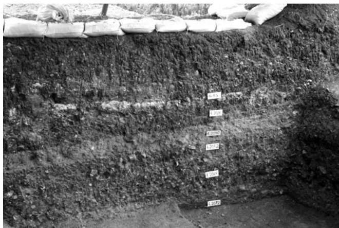
3. Stratigraphic levels at Tel Kabri in Israel. The history of the Middle Bronze II palace can be seen in the balk, in the form of several plaster floors with occupational layers, lying one on top of another.

Petrie also introduced the concepts of pottery typology and pottery seriation, in which he used the thousands of pieces of broken pottery he uncovered to determine the chronological date of the various levels and of the different cities that lay one on top of another within the mound that he was excavating. Essentially, Petrie realized that pottery types go in and out of style, just as today's fashions do, and can therefore be used to help date the various cities and stratigraphic levels within a single tell.