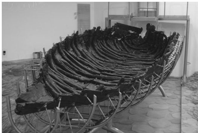
From the Galilee Boat to the Megiddo Prison Mosaic