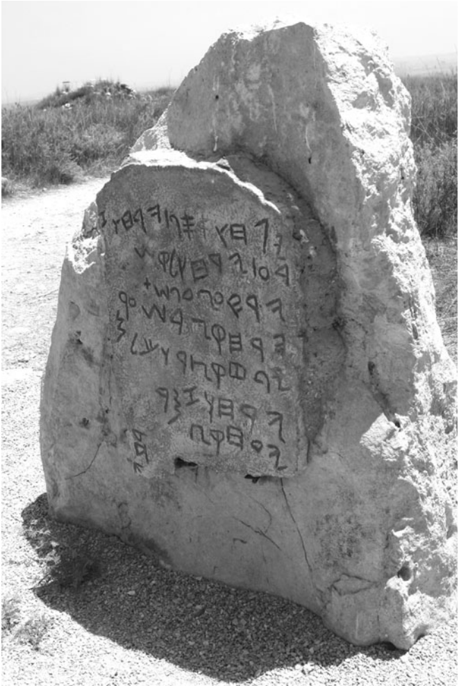
4. Reproduction of the Gezer Calendar, found by R. A. S. Macalister at Gezer, Israel, in 1908. Written most likely in paleo-Hebrew and dating to the tenth century BCE, the inscription describes the principal agricultural activities conducted during the year.