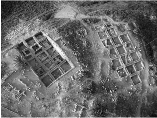
5. Overhead of Areas K and Q at Megiddo, end of the 2008 season. The use of Kenyon-Wheeler 5m x 5m squares in a grid pattern, with one-meter-wide balks between, can be clearly seen.

allowing the stratigraphy of the site to be examined and reexamined as necessary, not only by the original excavators but by subsequent archaeologists as well.